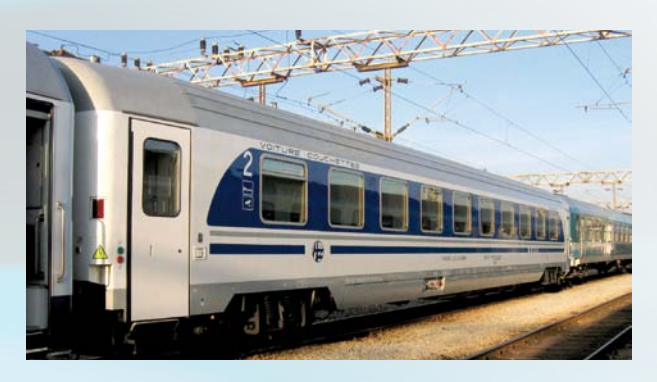
Croatian Railways couchette coach equipped with the converter KONTRAC PN60MS