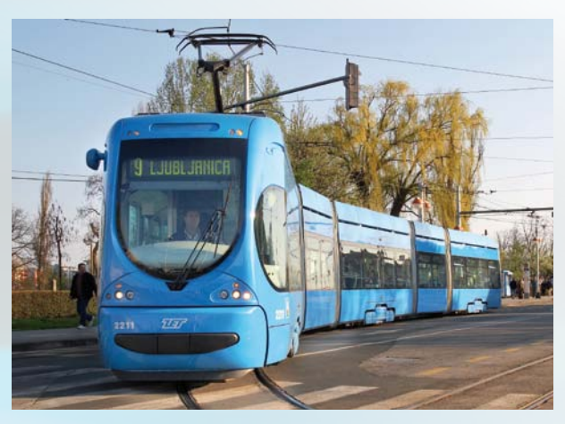
KONČAR tramway vehicle in Zagreb