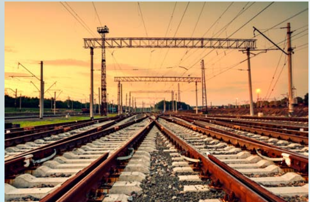
Two converters KONTRAC PN225AC will be installed in Mrzlo polje, Croatia.