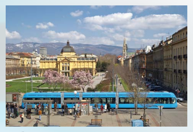
KONČAR tramway vehicle in Zagreb