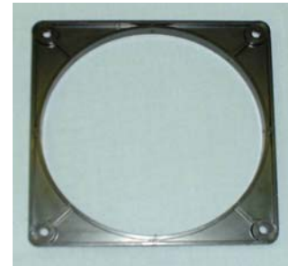
Inlet Ring improves air flow.

Units include Dual -115/230V AC Ball bearing fans Fan Finger Guard, Inlet Ring & Ducting.